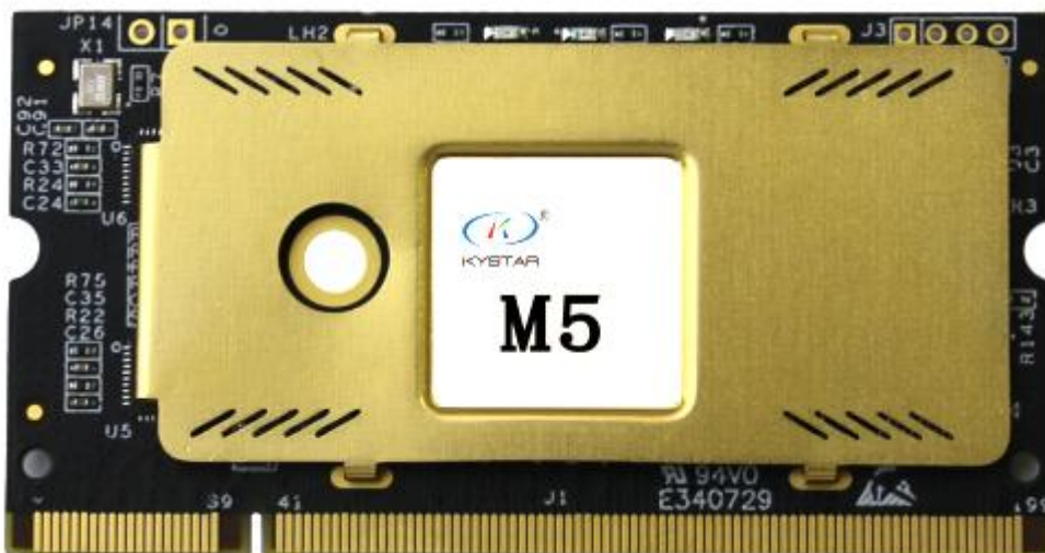
Figure 1 Front view of the M5 receiving card